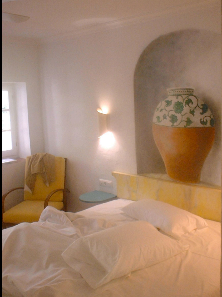
Hurricane Hotel Tarifa, Spain