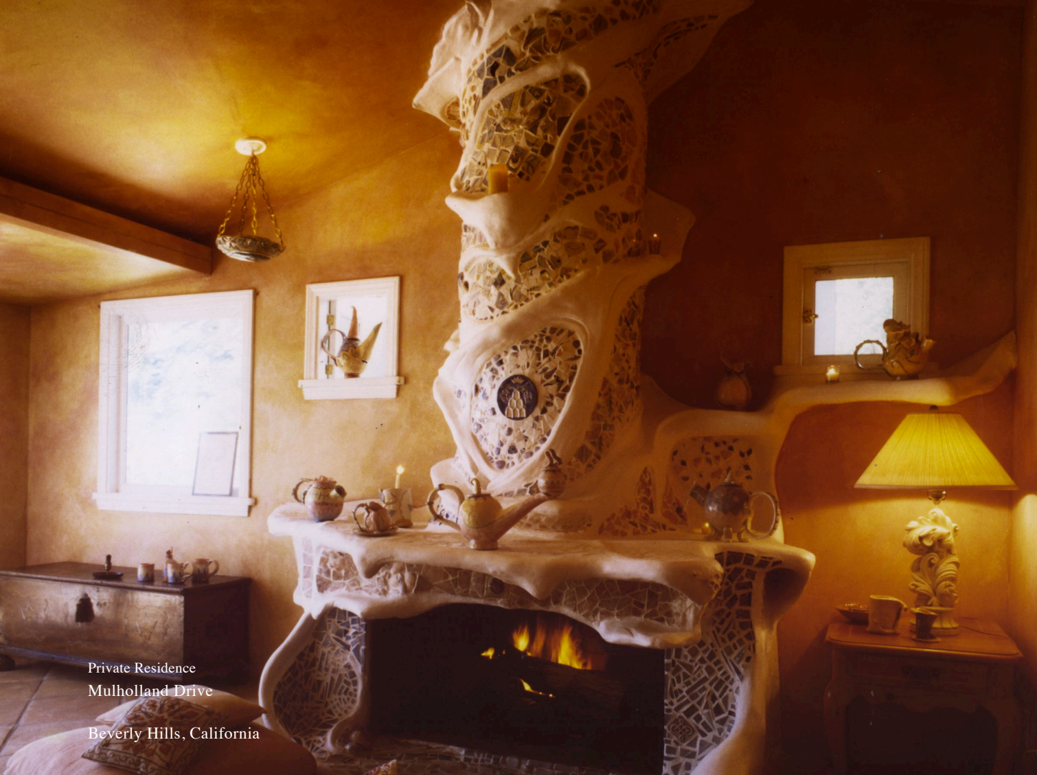
Private Residence Mulholland Drive Beverly Hills, California