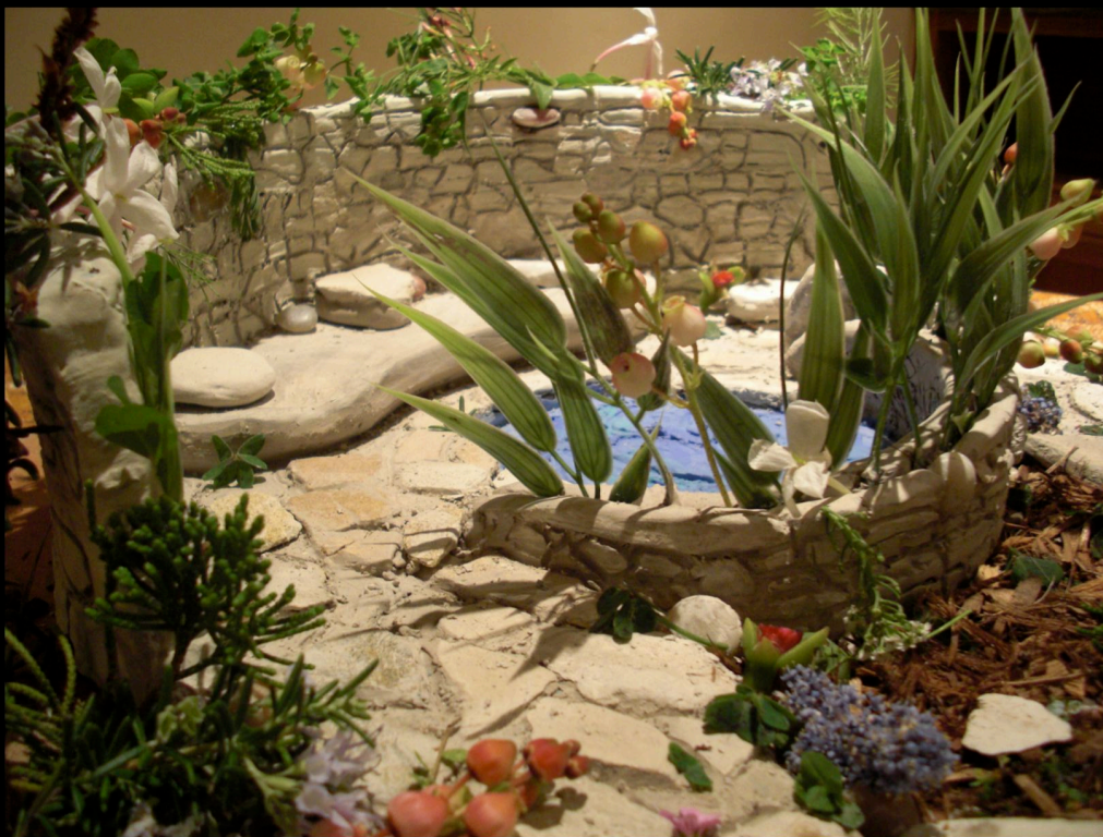
Model of jacuzzi Clay, bark & flowers